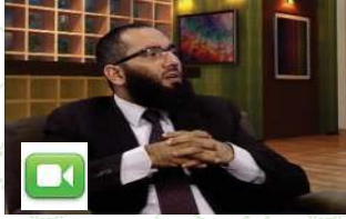
“I-Teen World” - By Mohammad Waseem