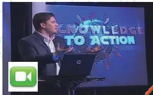
“Knowledge To Action” - By Sh. Mahdy Kaskas