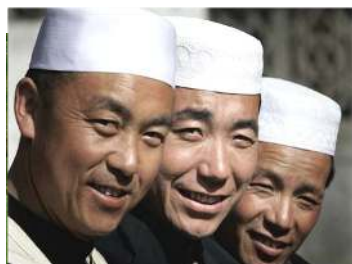
Muslims from the Far East

ALLAH WARNS THE MUSLIMS NOT TO FALL INTO THE SAME TRAP AS THE PEOPLE BEFORE THEM, BY DISPUTING WITH EACH OTHER AND SEPARATING INTO DIFFERENT RELIGIOUS GROUPS .