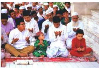
Muslims of different nationalities and races praying in the Holy Mosque at Makah

There is no compulsion in religion. Verily, the Right Path has become distinct from the wrong path. Whoever disbelieves in taghut (false gods and false worship) and believes in Allah, then he has grasped the most trustworthy handhold that will never break. And