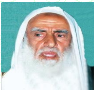
Shaikh. Muhammad Al-Othaimeen

It is Allah's favor upon us that He made seasons for His righteous worshippers to increase in their pious deeds. from these seasons: