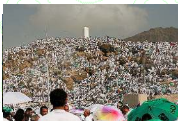
Pilgrims standing on the Mount of Arafat at the great hajj day!

Allah the Exalted says: {By the dawn;(1) By the ten nights (i.e. the first ten days of the month of Dhul-Hijjah)} [Surah Al-Fajr 89:1-2]