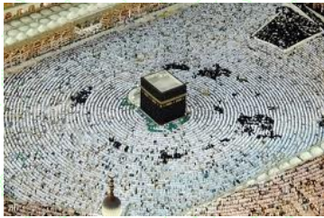
Millions of pilgrims praying at Haram and circling the Ka'ba during Hajj.

Allah the Exalted says: {By the dawn;(1) By the ten nights (i.e. the first ten days of the month of Dhul-Hijjah)} [Surah Al-Fajr 89:1-2]